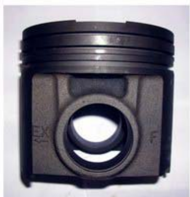
S6D140 6212-31-2151 Total Height 125.2mm, Combustion Chamber 78mm