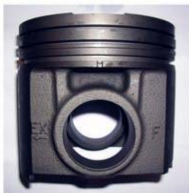
S6D140 6211-31-2111 Total Height 130.2mm, Combustion Chamber 92mm